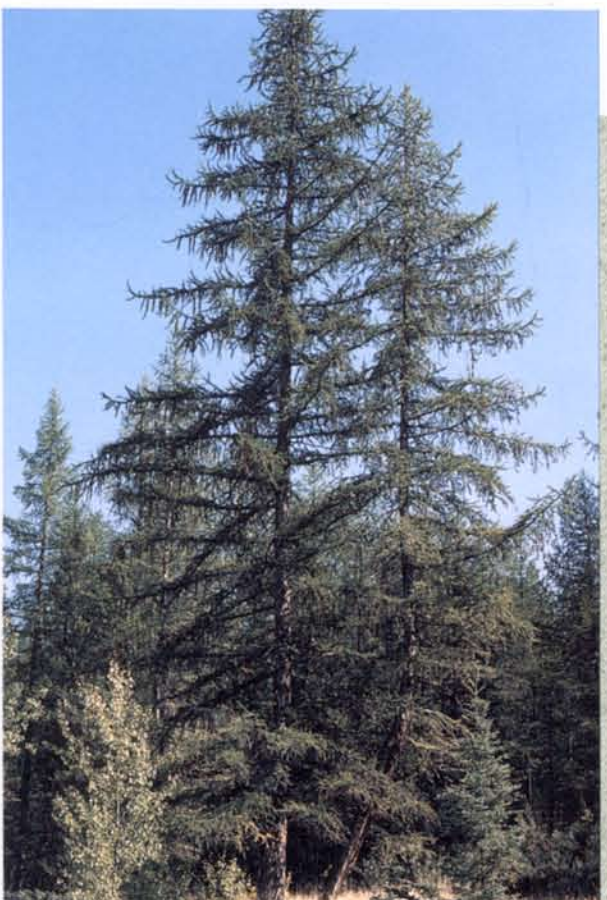
Western Larch Larix occidentalis Nutt. Habitat: moist to dry, often gravelly or sandy sites in upper foothills and montane zones. Rarity status: a few scattered occurrences along the mountains, primarily in the Crowsnest Pass area.