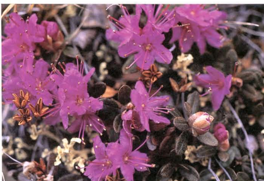
Lapland Rose-Bay Rhododendron lapponicum (L.) Wahl. Habitat: moist alpine slopes and upper subalpine sites near timberline. Rarity status: scattered localities in the North Saskatchewan and Athabasca River drainages.