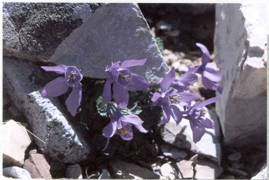
Jones' Columbine Aquilegia jonesii Parry Habitat: alpine scree slopes. Rarity status: occurring only in Waterton Lakes National Park.