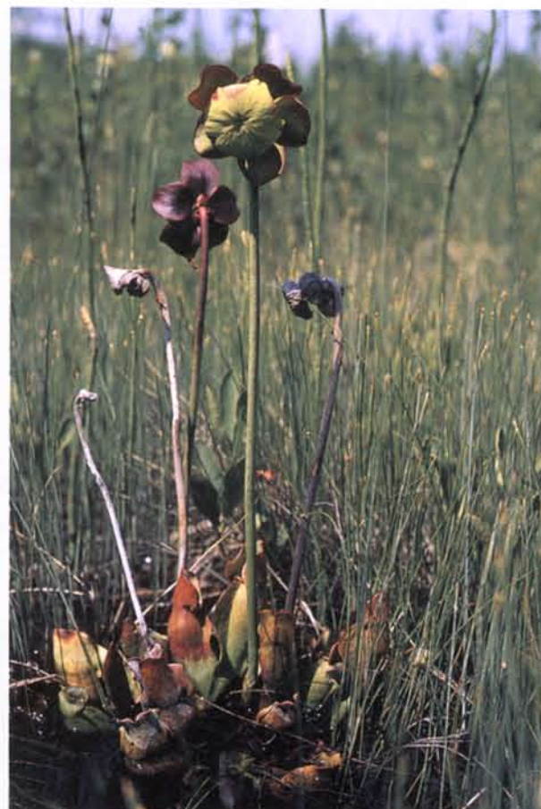
Pitcher-Plant Sarracenia purpurea L. ssp. purpurea Habitat: wetlands, often with sphagnum moss. Rarity status: Athabasca River drainage in the boreal forest; most occurrences in northeastern Alberta north of Fort McMurray.