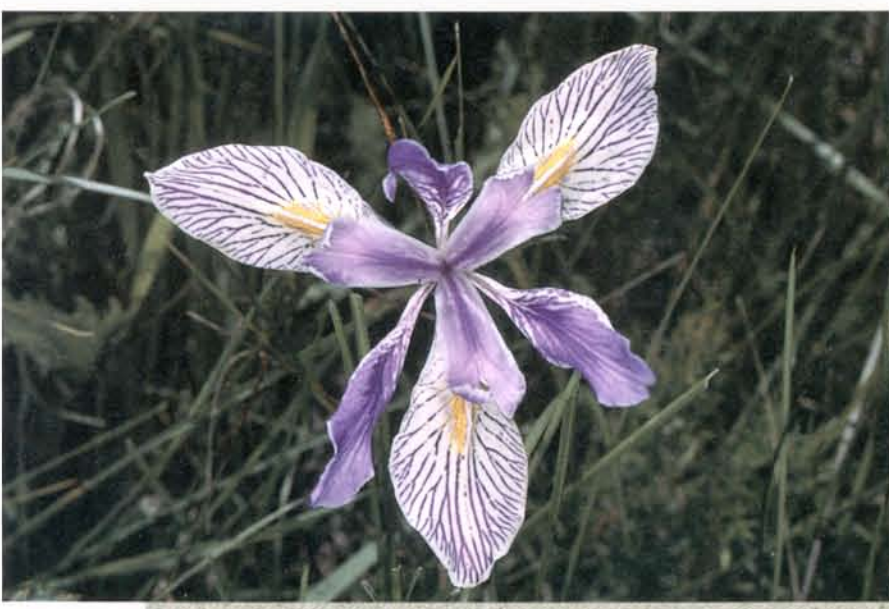
Western Blue Flag Iris missouriensis Nutt. Habitat: open, moist to wet meadows and streambanks. Rarity status: six localities in the foothills fescue grassland and foothills parkland sub-regions of southwestern Alberta.