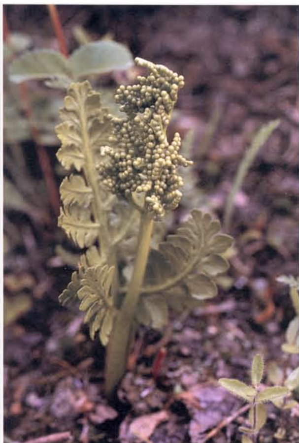
Triangle Moonwort Botrychium lanceolatum (S.G. Gmelin) Angström Habitat: mountain slopes. Rarity status: scattered localities in Banff and Jasper national parks.