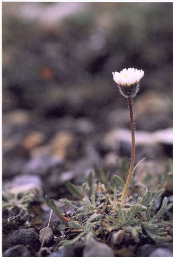
Trifid-Leaved Fleabane, Three-Forked Fleabane Erigeron trifidus Hook. Habitat: alpine slopes. Rarity status: about 7 localities from Banff National Park to Willmore Wilderness Park.