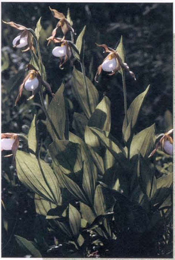
Mountain Lady's-Slipper Cypripedium montanum Dougl. ex Lindl. Habitat: moist open places in the mountains at elevations below 1700 m. Rarity status: scattered localities from Banff National Park to Waterton Lakes National Park.