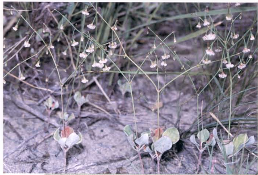
Nodding Umbrella-Plant Eriogonum cernuum Nutt. Habitat: coarse-grained sand in badlands, on dry valley rims and slopes, and on active sand dunes. Rarity status: about six localities in the grassland region of southeastern Alberta.