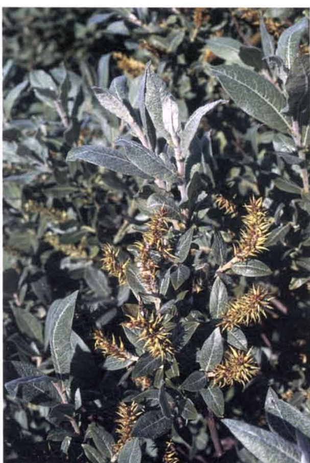
Changeable Willow Salix commutata Bebb Habitat: forms thickets in subalpine areas. Rarity status: about six localities in the mountains from Jasper National Park to Waterton Lakes National Park.