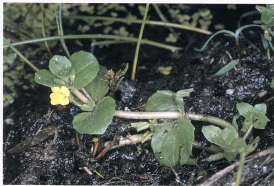
Smooth Monkeyflower Mimulus glabratus Kunth Habitat: wet places, often in water and around springs. Rarity status: only one population known in the central parkland sub-region.