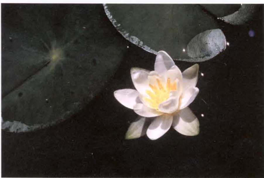
Pygmy Water-Lily Nymphaea leibergii Morong Habitat: quiet streams, ponds and lakes, usually in deep water. Rarity status: occurring only in Wood Buffalo National Park in extreme northern Alberta.