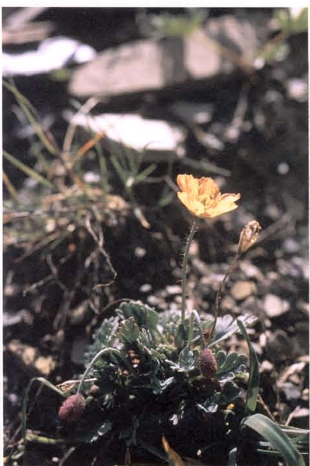
Dwarf Alpine Poppy Papaver pygmaeum Rydb. Habitat: alpine scree slopes and ridges. Rarity status: occurring only in Waterton Lakes National Park.