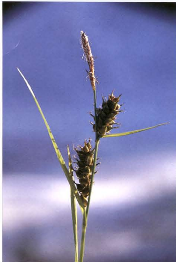
Sand Sedge Carex houghtoniana Torr. Habitat: dry, acidic, sandy or gravelly places in the boreal forest, often in pine woods. Rarity status: fewer than 10 widely scattered localities, primarily in the Athabasca River drainage.