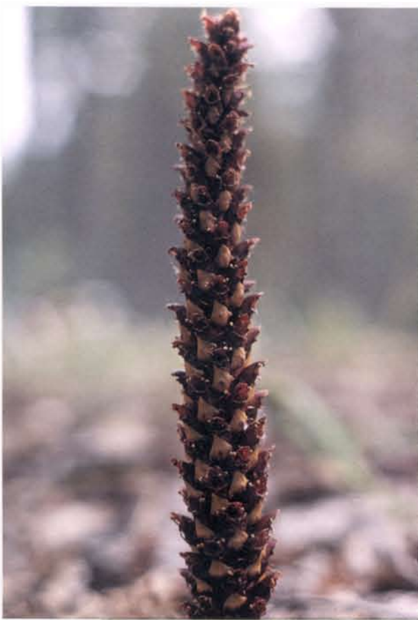
Russian Ground-Cone Boschniakia rossica (Cham. & Schlecht.) Fedtsch. Habitat: beside, and parasitic on, green alder in open, wooded or shrubby areas. Rarity status: occurring only in the Caribou Mountains in extreme northern Alberta.