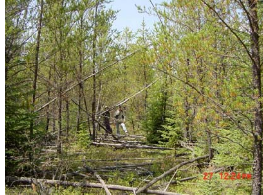
Picture 3. The 1977 forest-fire site (77F) near Weyakiwin Lake, Central Saskatchewan

measured with open path IRGA analyzers at 9.1 and 12.1 m height, respectively.