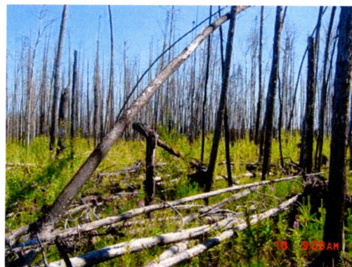
Picture 1. The 1998 forest-fire site (98F) in Prince Albert National Park, Central Saskatchewan.

The 98F site (Picture 1), established in 2001, is characterized by numerous trembling aspen suckers to a height of about 1 m, with smaller regenerating jack pine and black spruce seedlings. Dead tree boles are still standing but there is also much deadfall and soil exposed.