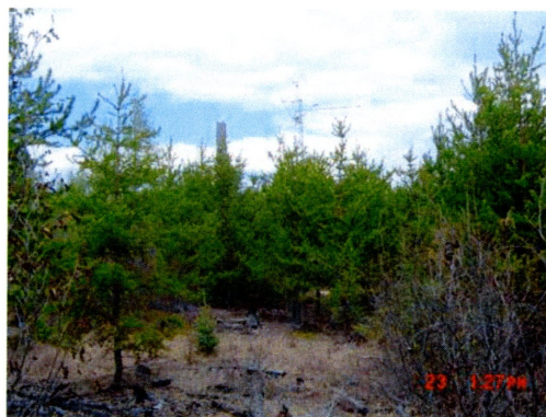
Picture 2. The 1989 forest fire site (89F) near Montreal Lake, Central Saskatchewan.

The 89F site (Picture 2), also established in 2001, is vegetated by jack pine trees, about 3 m height, with some trembling aspen, balsam poplar and black spruce. The 77F site (Picture 3), established in the summer of 2003, is characterized by an average canopy height of about 7.5 m, composed mainly by jack pine as the tallest trees, and black spruce in the sub-canopy.