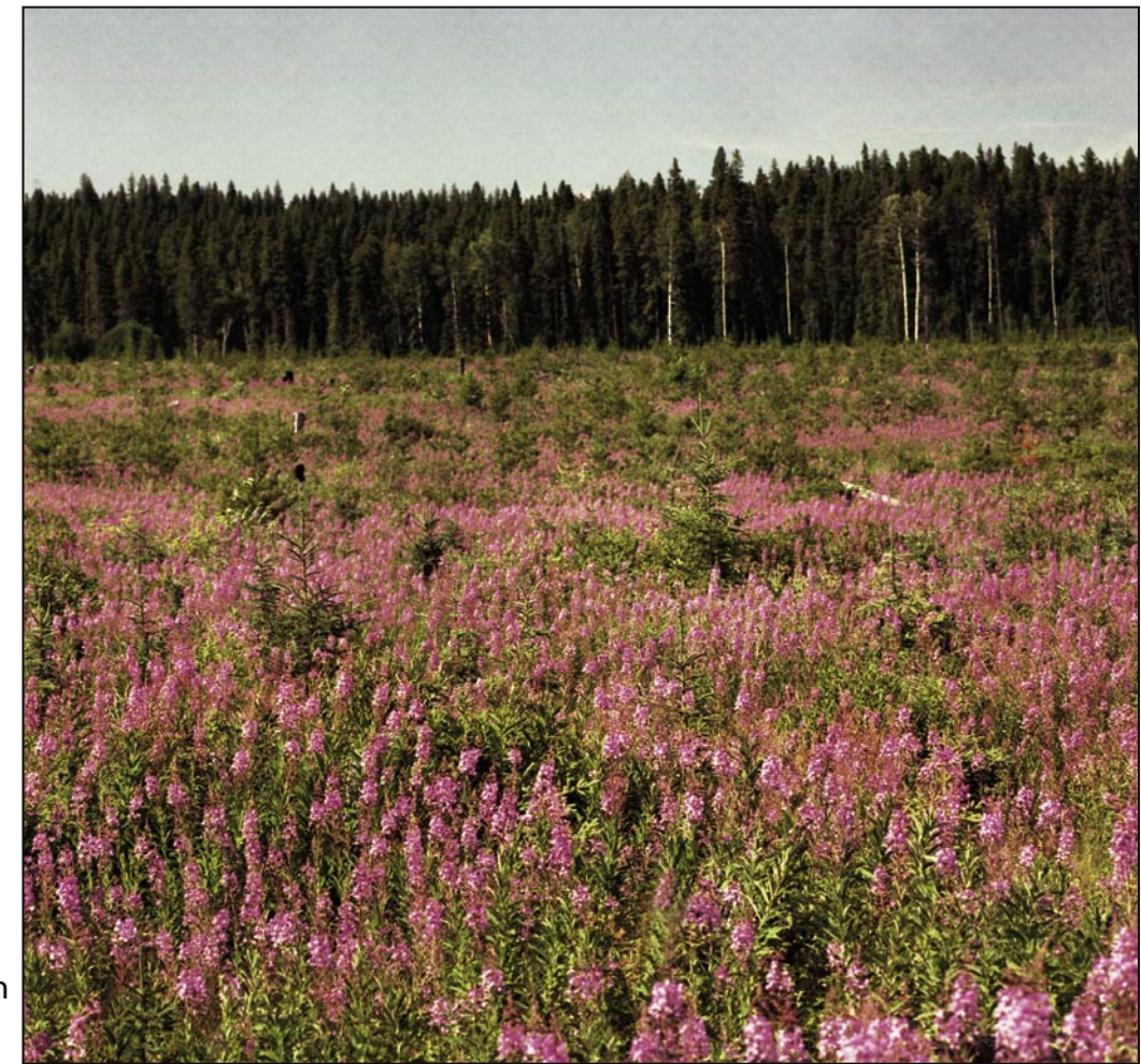
The initiative supports sustainable forest practices.

A maximum of 10 per cent of funds received through the program may be used for project management and administration. Up to five per cent may be used for minor capital items.