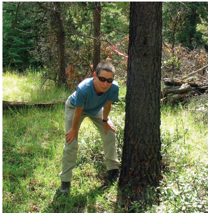
Assistance is available to private forestlands through the initiative.

The mountain pine beetle infested area ranges from Smithers east to the Rocky Mountains.