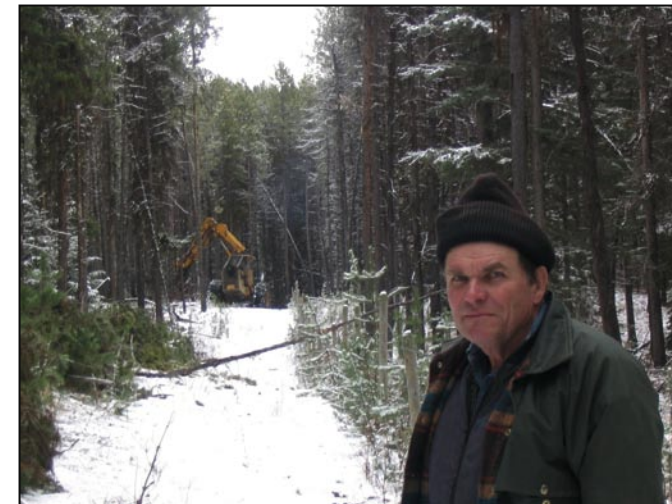
Through the program landowners are protecting forests now and in the future.

This publication is funded by the Government of Canada through the Mountain Pine Beetle Initiative, a program administered by Natural Resources Canada, Canadian Forest Service.