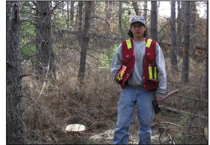
First Nations band members work to implement beetle management strategies.

The program also assists with implementation and minor road improvements.