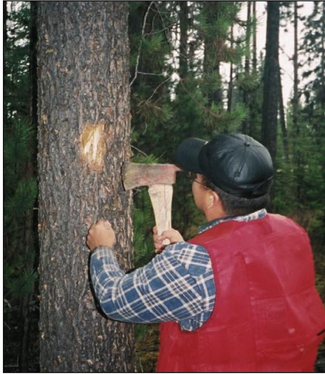
Many First Nations successfully participate in the program.

The Federal Forestlands Rehabilitation Program – First Nations Element is part of the Government of Canada's Mountain Pine Beetle Initiative. The initiative is a six-year $40 million investment to respond to the mountain pine beetle epidemic in western Canada.