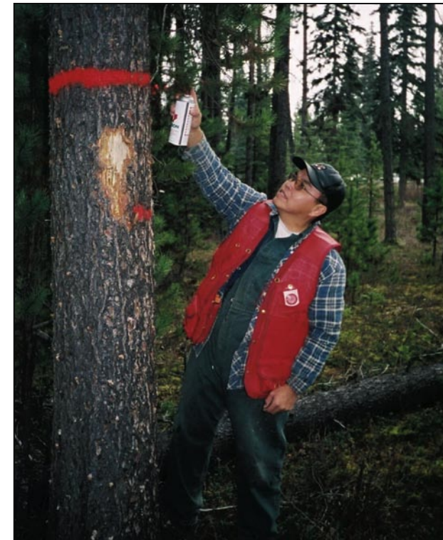
Forest health is a priority for many First Nations.

This publication is funded by the Government of Canada through the Mountain Pine Beetle Initiative, a program administered by Natural Resources Canada, Canadian Forest Service.