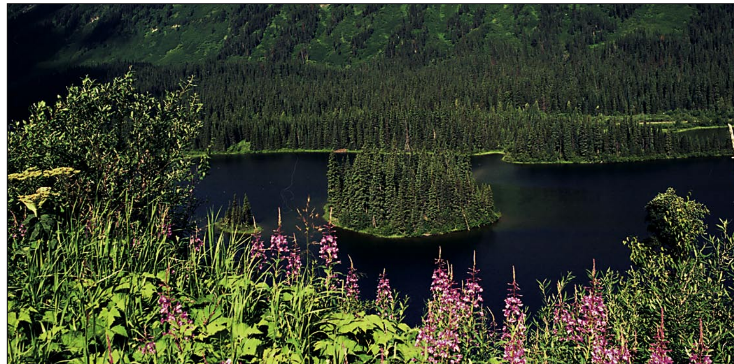
Healthy, thriving forests enhance the value of federal lands for all Canadians.

First Nations must contribute at least 20 per cent of the approved eligible costs. This contribution can be in-kind or in cash. In-kind contributions are cash-equivalents that are real and measurable. Examples of in-kind contributions include labour, supervision, equipment, supplies, office space/materials, and management, technical or professional services.