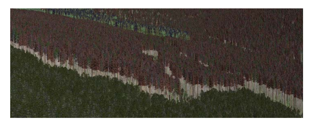
Figure 3: Midrange view (viewpoint 3)