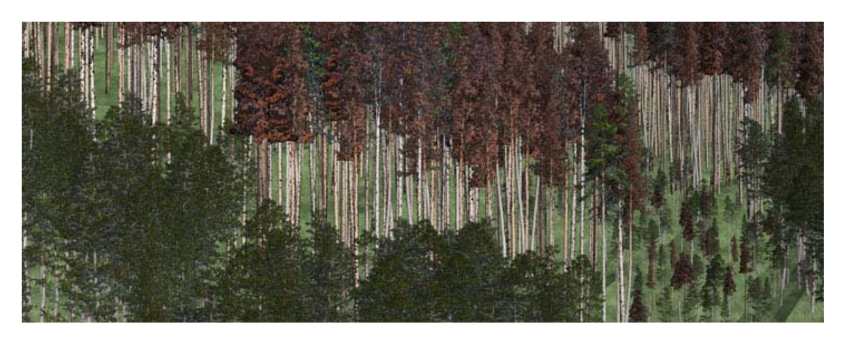
Figure 4: Detail view (viewpoint 4)