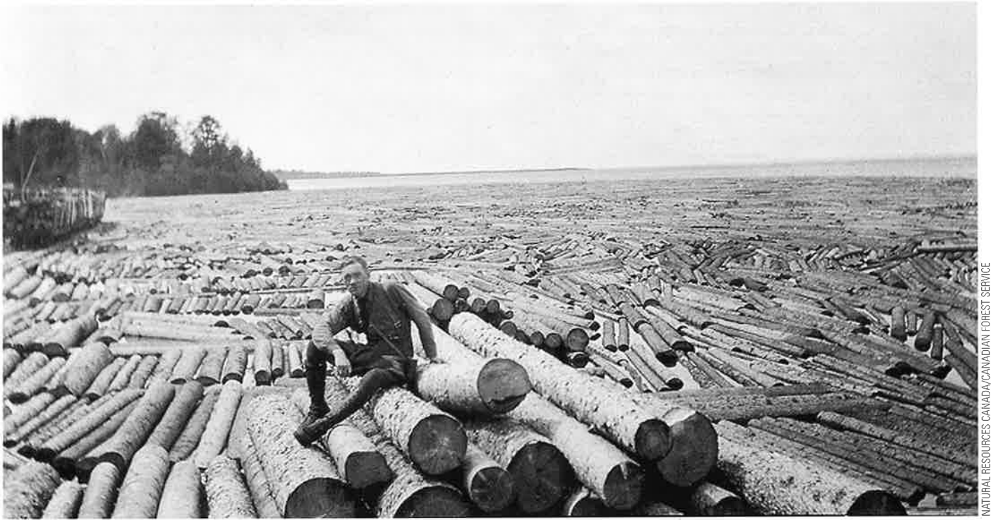
NATURAL RESOURCES CANADA/CANADIAN FOREST SERVICE