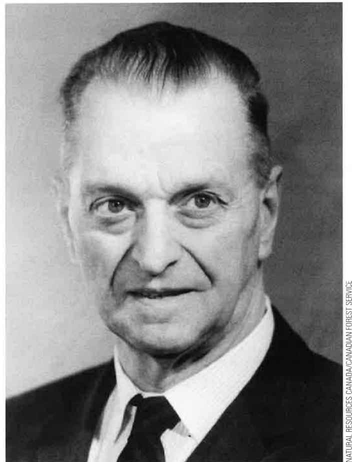
NATURAL RESOURCES CANADA/CANADIAN FOREST SERVICE

Initially, agreements were concluded with provincial governments for federal funds to finance inventory and reforestation programs, to purchase fire-fighting equipment and to build access