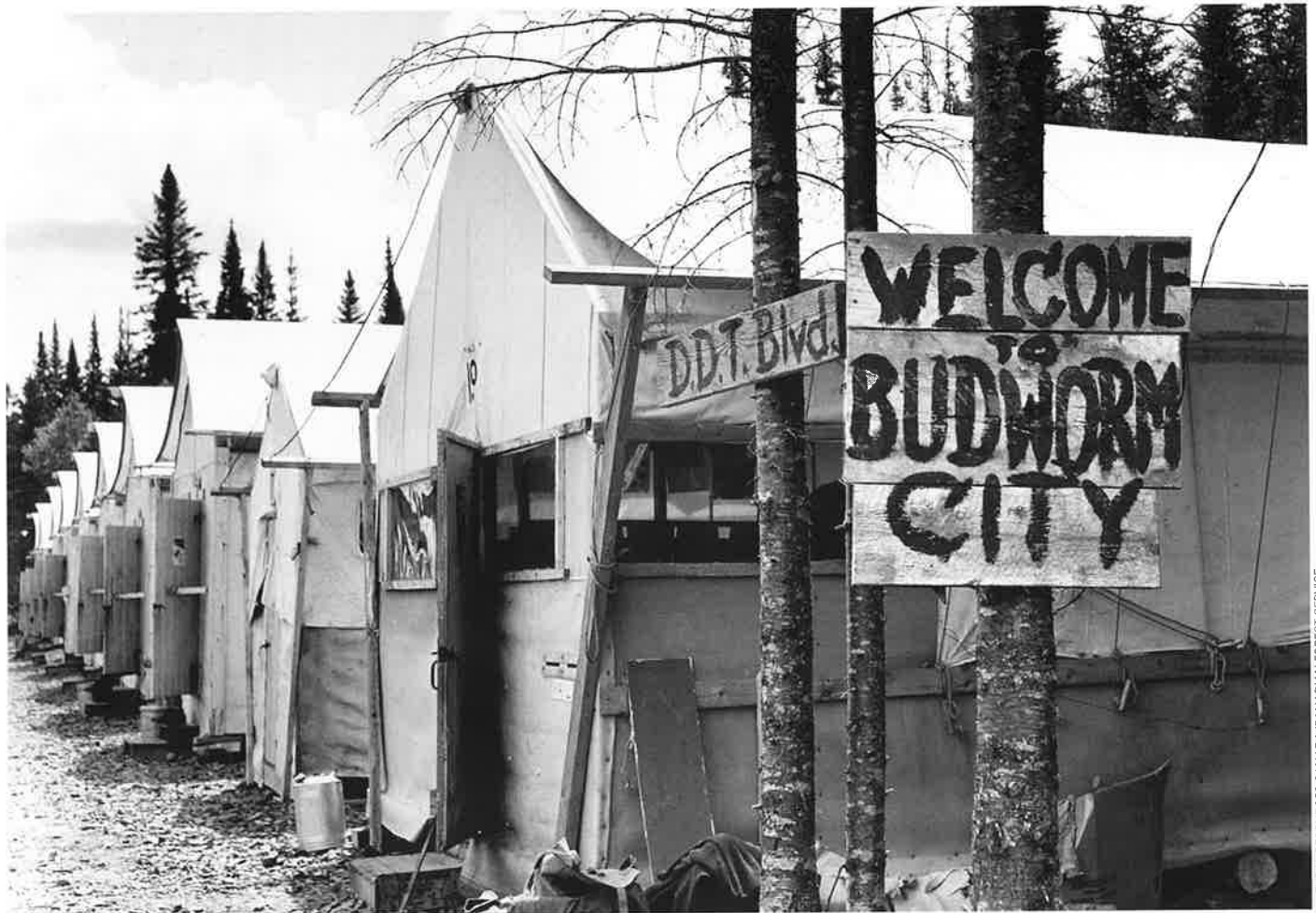
Budworm City was the name given to the camp that sprang up alongside one of the first airstrips built in the bush in 1952 for budworm spraying. It was in the upper Upsalquich River country, 50 or 60 miles south of Dalhousie, New Brunswick. By the early 1960s, it had evolved into a camp for pulpwood cutters. The CFS had a small field station nearby and field researchers would sometimes get their meals there.

Following a change of government, Reed was appointed CFS assistant deputy minister in 1980, a clear break with a long