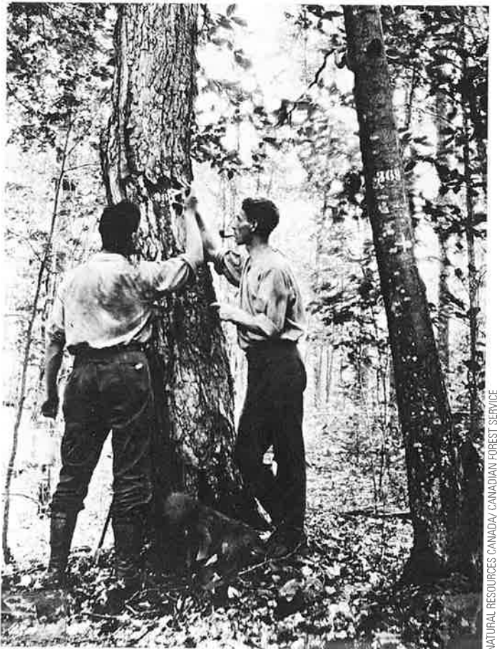
Researchers number a tree on a permanent sample plot in the Petawawa Research Forest in 1919.

Following a particularly bad fire season in 1919, the branch stepped up its work on protection. Aerial fire patrols were initiated in Alberta and BC. In addition to spotting and reporting fires, the air patrols dropped leaflets over campsites and small towns to educate the public about forest protection, the beginning of what eventually became a large public information program. A fire research program was established at Petawawa and within a few years produced a unique method of forecasting fire hazards.