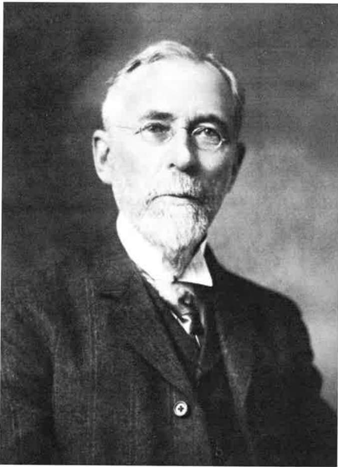
Elihu Stewart, Canada's first superintendent of forestry, from 1899–1907.

The first economic use of these forests by Europeans, in collaboration with aboriginal residents, was to harvest fur. For several centuries, this was a sustainable use that maintained forest habitat and wildlife populations. As settlement began, the forests, which covered most of the land, were seen as obstacles to the primary goal of the colonial era, the building of an agricultural economy. The forests, at best, were looked upon as a non-renewable resource, like a mineral deposit. They could be harvested once for whatever value they might bring in the timber trade, after which the land would be settled and farmed, as had been the experience in the homelands of the settlers.