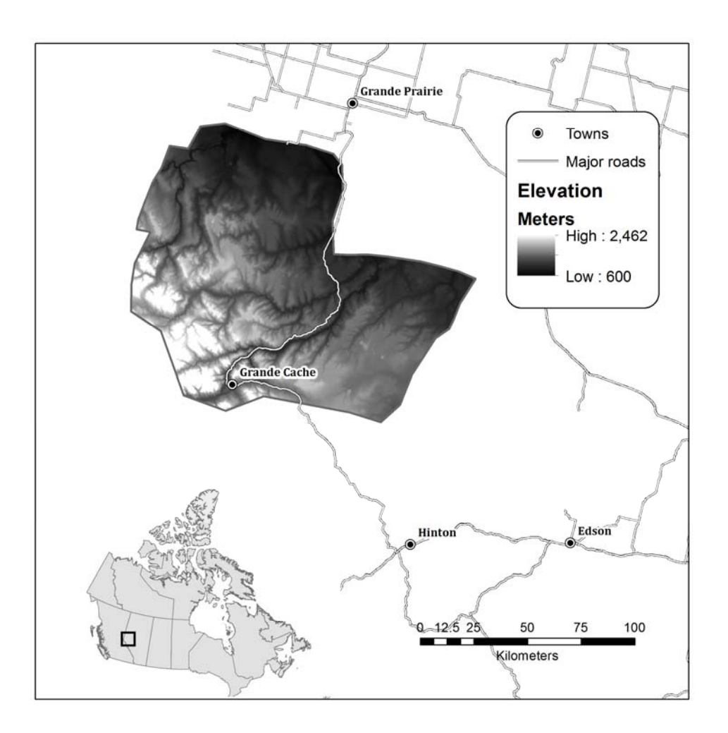
Figure 1. The location of the grizzly bear study area located in the Kakwa forest region, of the eastern foothills of the Rocky Mountains, Alberta, Canada, 2005–2009. Centered at 118° W and 54° N, the study area was west of Edmonton, Alberta, Canada.