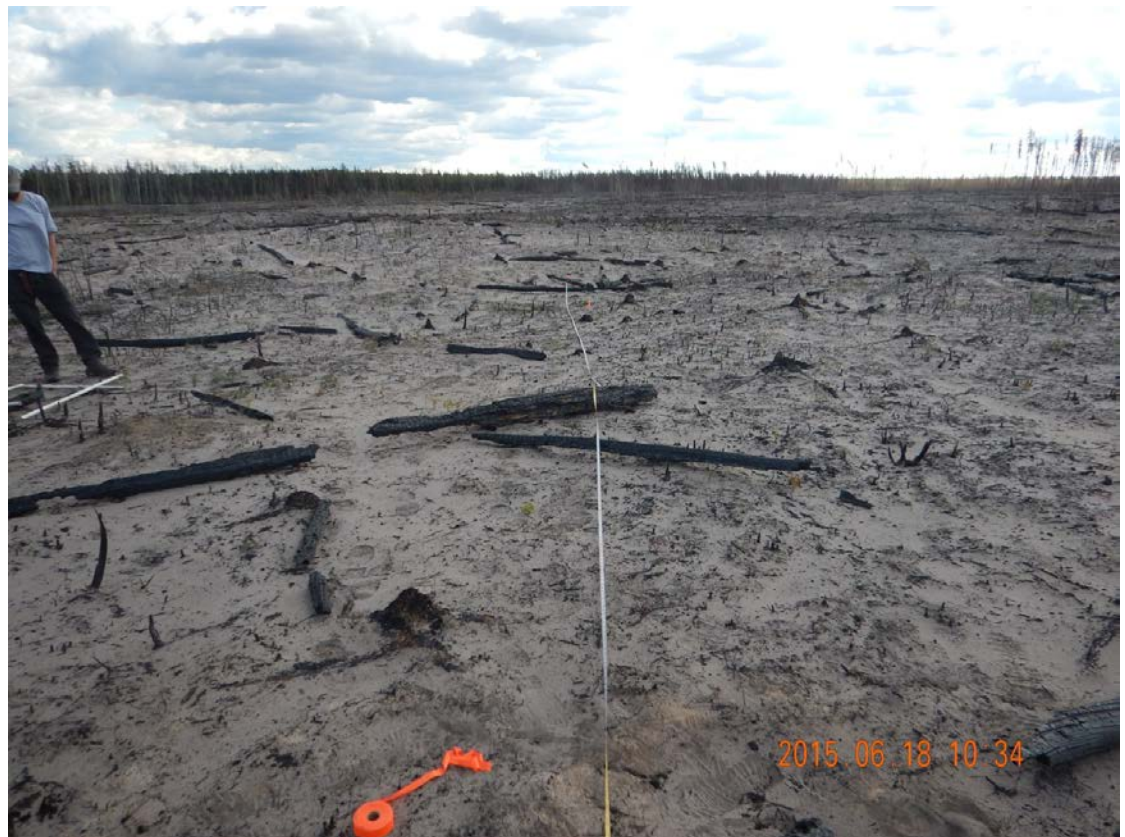
Figure 1. A patch of forest that burned at a very high intensity during a 2014 wildfire in Wood Buffalo National Park . One year after fire, there is very little biomass remaining on site and few tree seedlings to ensure the re-establishment of the forest cover.

In the summer of 2014, the Northwest Territories experienced a truly exceptional fire season. More than 380 fires burned a record 3.4 million hectares — an area larger than Vancouver Island. Some fires burned so intensely that the areas resembled a lifeless desert once the fires were out (Figure 1). A team of researchers from the Canadian Forest Service (CFS) and the University of Alberta are investigating how the difference in burn severity in the 2014 wildfires may affect the ability of a forest to recover. They are studying vegetation species growing on the forest floor, tree species, and animals, birds and insects.