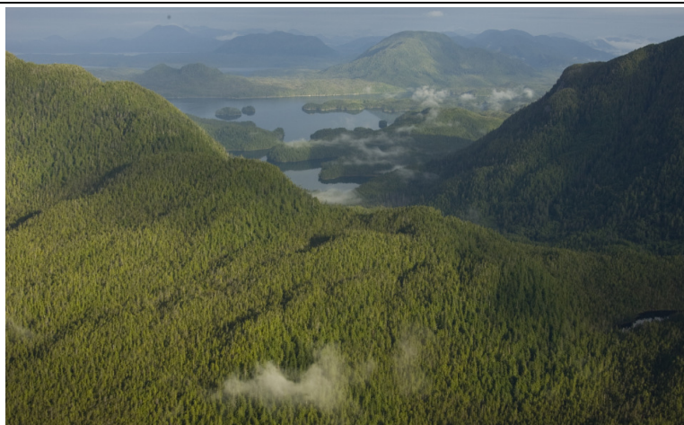
Old-growth coastal rainforest dominated by western hemlock ( Tsuga heterophylla) and western red cedar ( Thuja plicata). Central coast of British Columbia (Great Bear Rainforest).

Three subtypes characterize regional variation in the Canadian range of M024. CM024a [Drier Vancouverian Rainforest] primarily occurs in drier climatic areas where there is a history of fire. Coast Douglas-fir co-dominates in the canopy. Conversely, CM024c [Northern Vancouverian Rainforest] describes the Canadian expression of Pacific coastal rainforests at the northern edge of their global range. These forests are dominated by western hemlock and Sitka spruce and notable for the absence of Pacific silver fir and coast Douglas-fir. CM024b [Typic Vancouverian Rainforest] is the predominant condition occurring over most of the Canadian range.