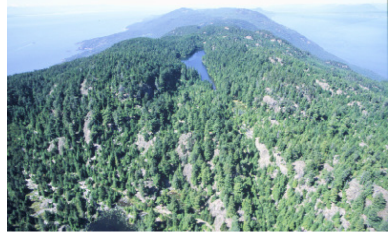
Patchy forest cover dominated by coast Douglas-fir ( Pseudotsuga menziesii var. menziesii ) on shallow rocky terrain on Texada Island, British Columbia.

In Canada, M886 forests occur between sea level and approximately 700 mASL in a cool Mediterranean climate, with moderately warm dry summers and mild wet winters. Mean annual precipitation varies between approximately 650 and 1250 mm, the majority falling as rain in winter months; snow is uncommon and ephemeral. Mean annual temperature is approximately 8° to 10° C; soils do not freeze in winter. Growing degree days above 5° C (GDD) vary between approximately 1700 and 2200 across the Canadian range. All parts of the Canadian range experienced Pleistocene glaciation; soils are mostly Brunisols developed in glacial surficial materials. Mor and moder humus forms predominate.