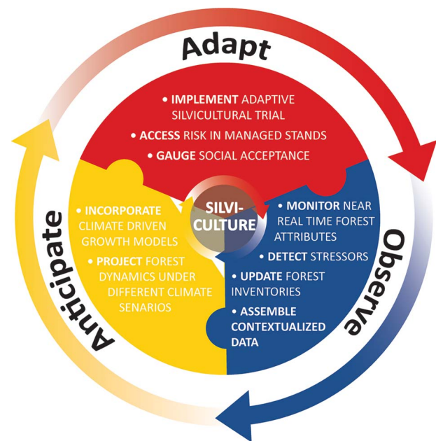
Figure 1 Our conception of silviculture as holistic scientific discipline is framed by three key themes: observe, anticipate and adapt.

The idea for this review initiates from a workshop on the future of silviculture held in Montreal in March 2019. Researchers and practitioners from across Canada had the chance to exchange