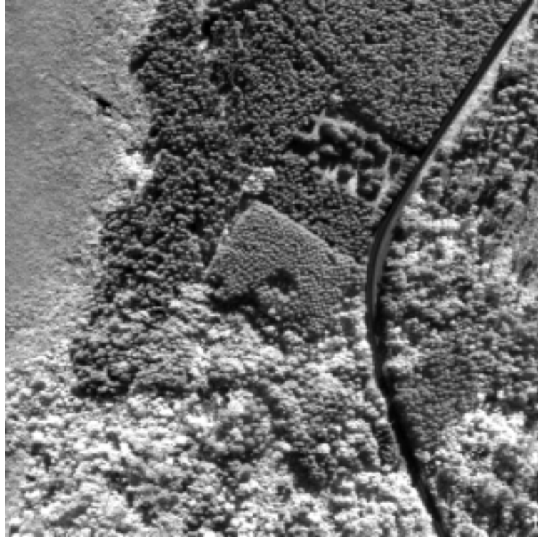
Figure 1 - Representative section of one of the 36cm/pixel MEIS-II image strips acquired on August 16, 1988, over the Petawawa National Forestry Institute's experimental forest.